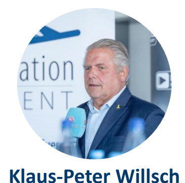
MdB, President, PRO Flughafen and Chairman of German Federal Parliament's Aerospace Group