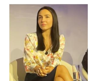
Global Public Speaker, Former Member of the European Parliament and CCO, Ariva Digital