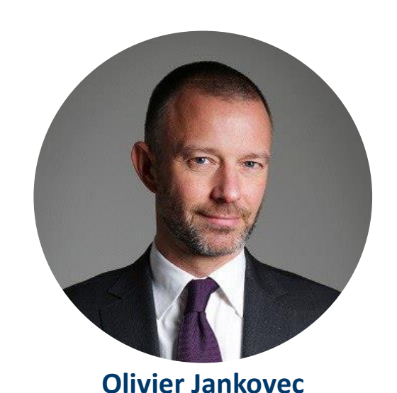
Director General, Airports Council International (ACI) Europe